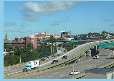
1-81 in Syracuse, NY.

Syracuse, NY, in partnership with the metropolitan planning organization and the New York State Department of Transportation (NYSDOT), launched the I-81 Challenge to gather input and assess options for the 1.4 mile segment of Interstate 81, known locally as “the viaduct”, an aging, elevated freeway that cuts off Syracuse University from the downtown. As stakeholders began to consider the fate of the viaduct, representatives from the city, university, metro area, and state agencies issued a letter calling for a collaborative effort to evaluate the alternatives and decide whether to replace, repurpose, or rebuild the highway. 75 This process can serve as a model for other communities wrestling with similar decisions.